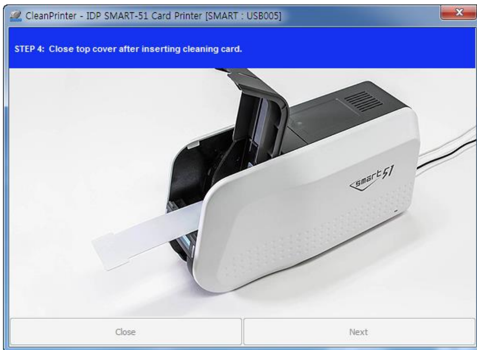
Figure 109 Printer cleaning Step 4

Step 4. Close the top cover to clean the Thermal Print Head and the printing roller. When the top cover is closed, cleaning card will be moving back and forth to clean.