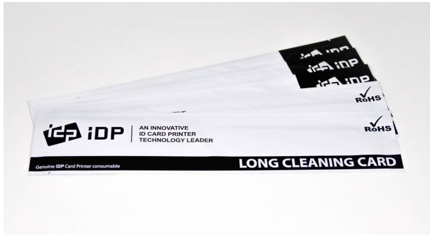
Figure 104 Exclusive long cleaning card for SMART-51 printer

To maintain the best condition of SMART-51 printer, you must clean the printer periodically. If you use the exclusive long cleaning card as the picture, you can clean the printer easily. For purchase the exclusive long cleaning card, ask to SMART-51 printer provider.