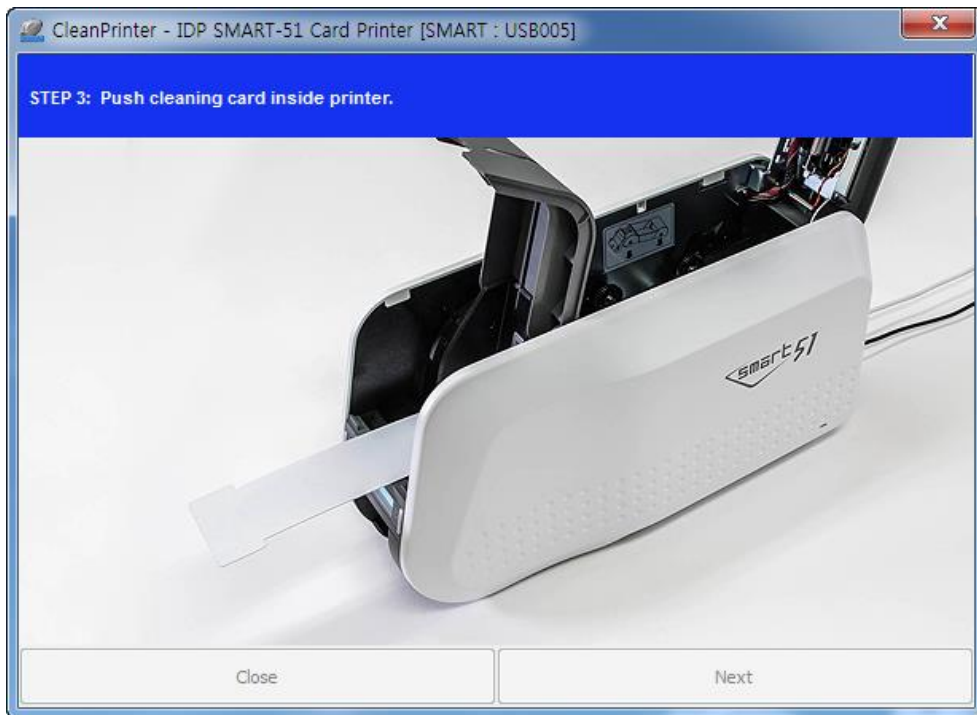
Figure 108 Printer cleaning Step 3

automatically. It is normal that the exclusive long cleaning card is inserted to the ends and rollers are moving to clean.