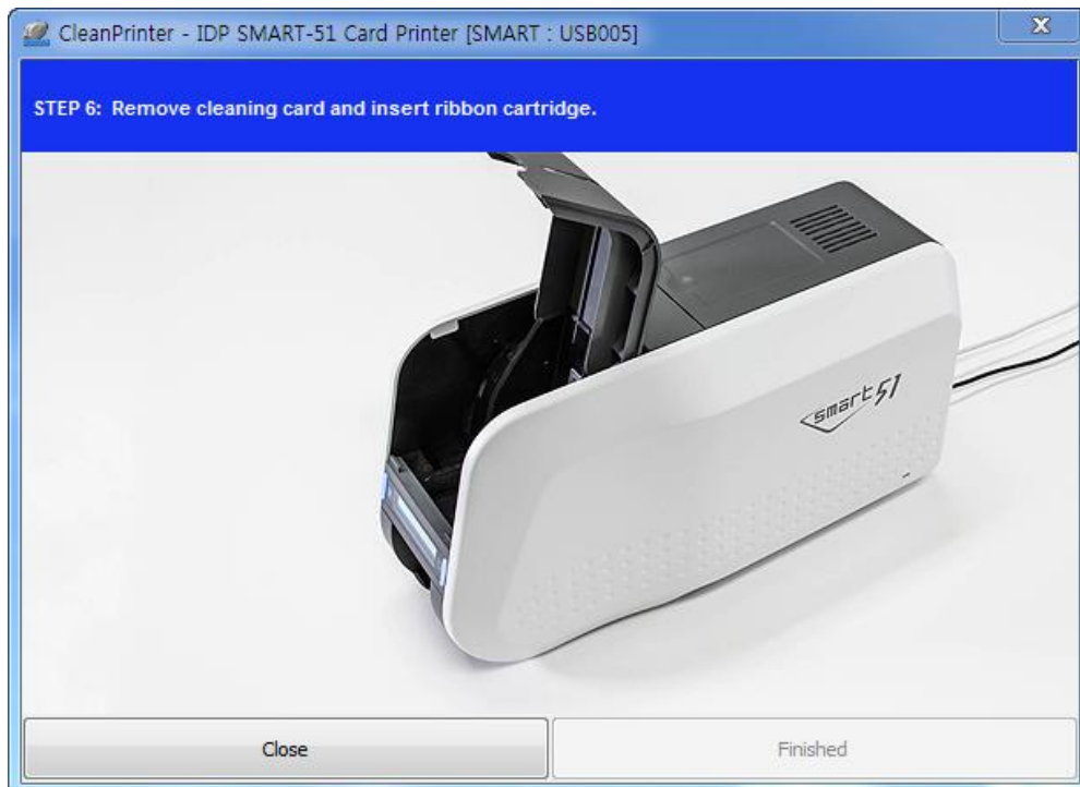
Figure 111 Printer cleaning Step 6

Step 6. Remove the exclusive long cleaning card and install ribbon cartridge into the printer.