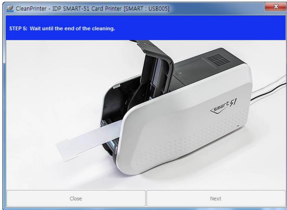
Figure 110 Printer cleaning Step 5

Step 5. Wait until the cleaning is completed. When the cleaning is completed, the exclusive long cleaning card will be ejected automatically as the picture.