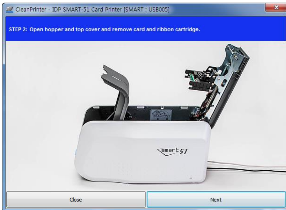
Figure 107 Printer cleaning Step 2

Step 2. Open the hopper and top cover and remove the card and ribbon cartridge.