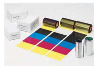
Ink Ribbon & Retransfer Film

©2009 Dai Nippon Printing Co., Ltd. All rights reserved. All trademarks and brand names are properties of respective companies. Due to policy of continuous development, specification and information are subject to change without prior notice.